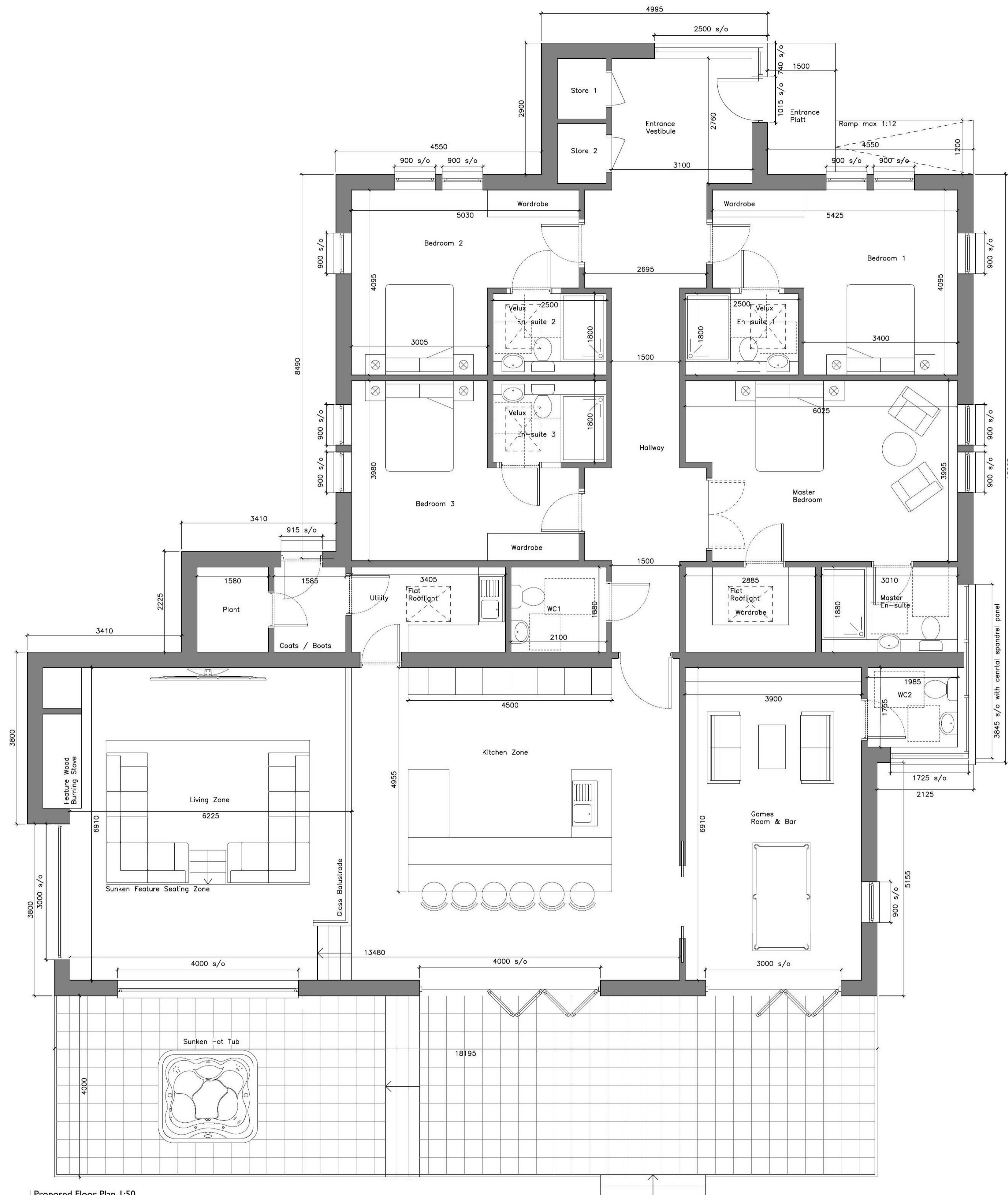
Proposed Floor Plan 1:50